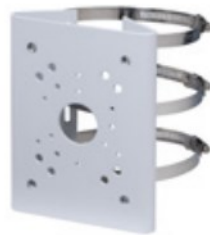
Pole Mount Bracket